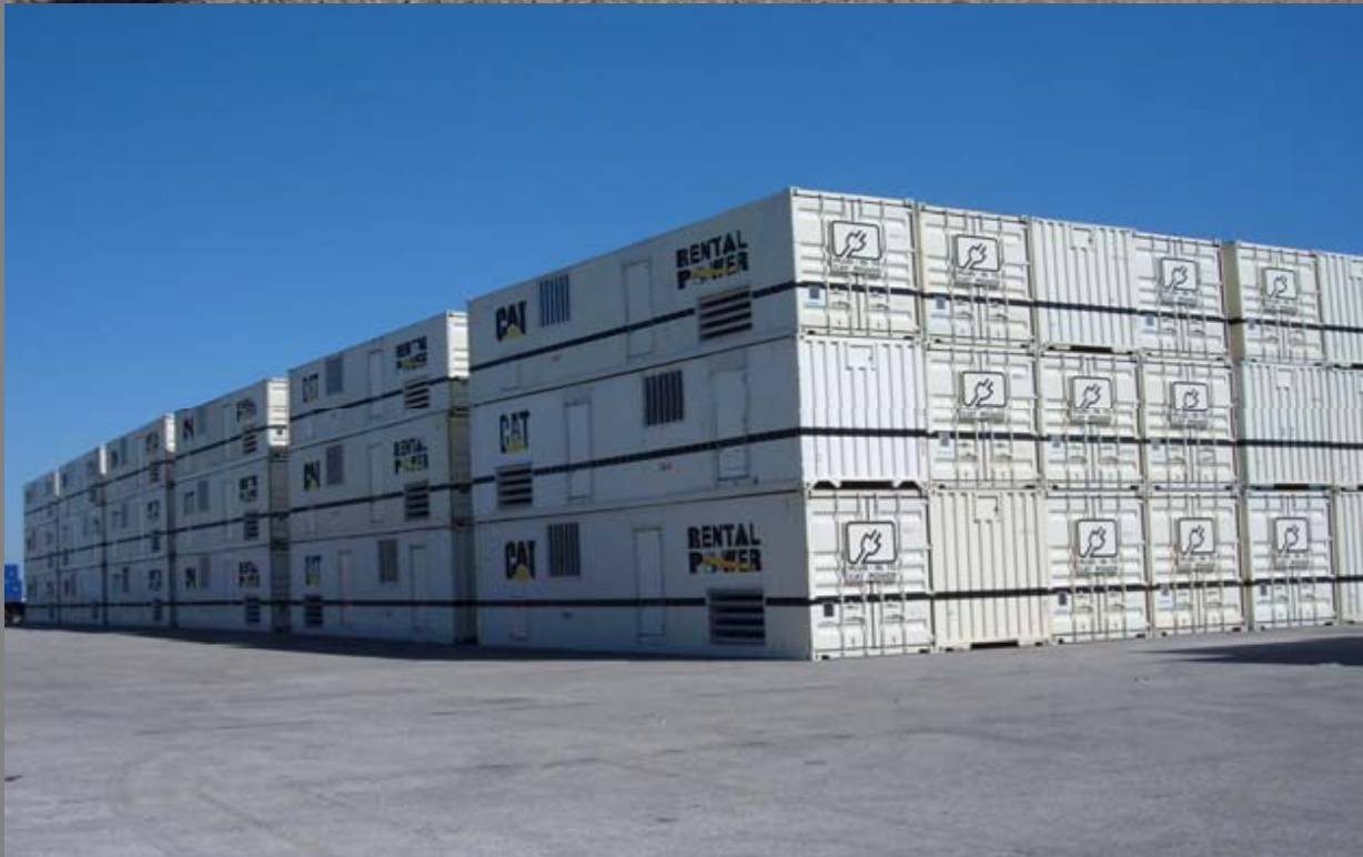
Power Modules Ready for Shipment